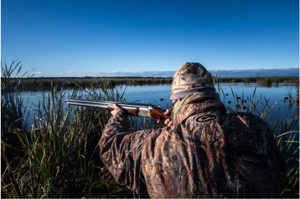
A duck hunter at Connewarre Wetland, on the Bellarine Peninsula.

An alliance of powerful trade unions has vowed to ban state Labor MPs from Big Build projects and walk off job sites if Victoria decides to end the practice. A parliamentary committee is examining whether <u>duck hunting should be</u> <u>stopped</u>.