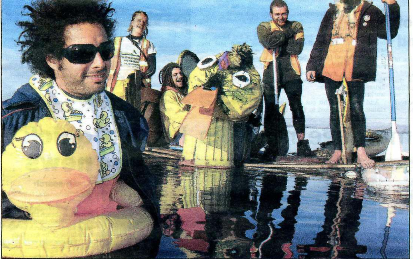
PROTECTION FORCE: Anti-duck hunting activists patrol Moulting Lagoon near Coles Bay yesterday. The campaigners were trying to discourage ducks from flying over the hunters' hides at the official start of duck hunting season.