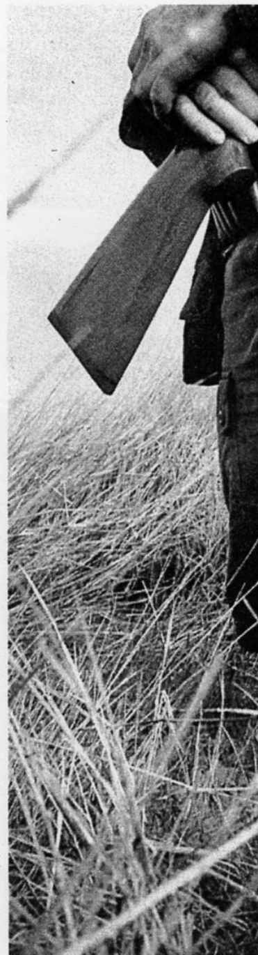
Licence to kill: After a two-year lull, Victo